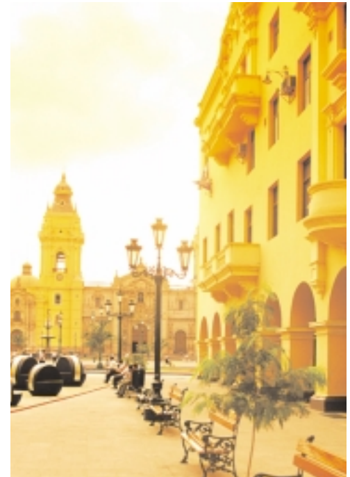
Lima – Plaza de Armas