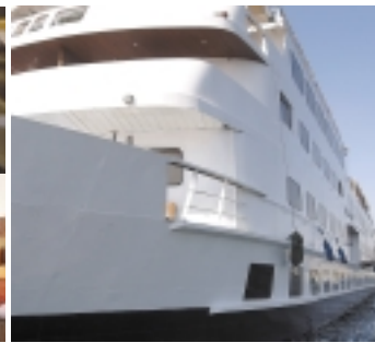
Alexander The Great