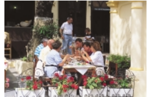
A Greek taverna