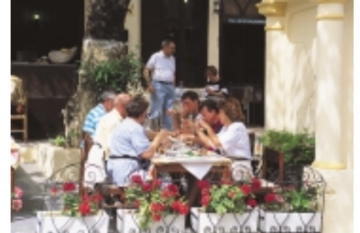
A Greek taverna