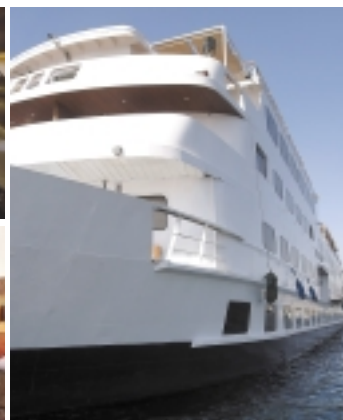
Alexander The Great